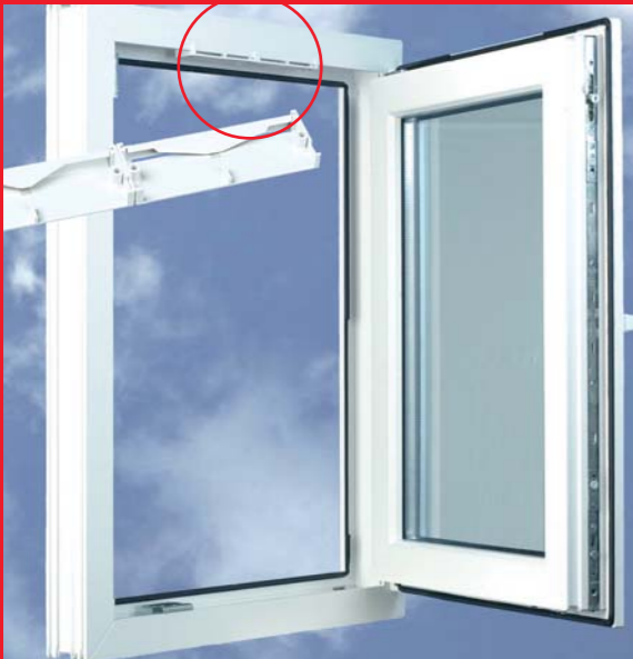
REGEL-air® with WV