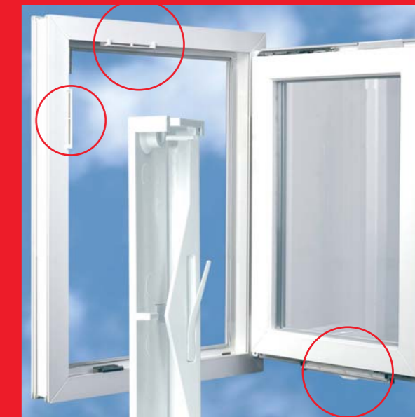
REGEL-air® PLUS with WV + FR

The pleasures of ventilation – for a healthier home thanks to REGEL-air®